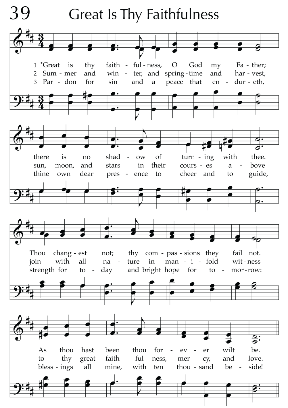
*Or "Great is thy faithfulness, O God, Creator."

Written as a meditation on Lamentations 3:22–23, this text is one of the few hymns among the 1200 poems by this Methodist writer and pastor that has gained much currency. The tune that appears here was composed especially for these words, and the pairing has proved enduring.