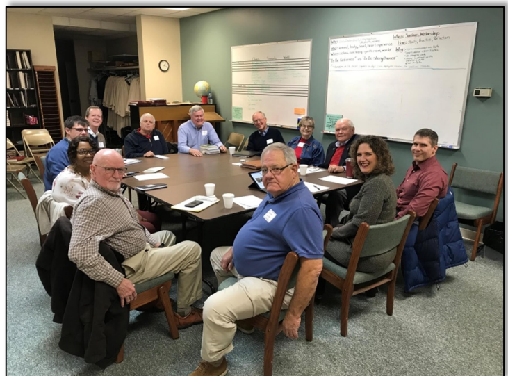
Abbeville/Greenwood area PC(USA) pastors and friends gathered at WPC for a cluster working session