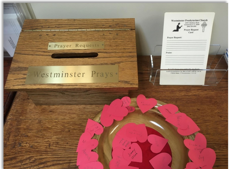
The staff, officers and Sunday Study class and congregation pray for one another, our community, and world. Prayer boxes and prayer sheets are available in our narthex and office hall. Please share your joys and concerns with us, so we can hold them before God in prayer.